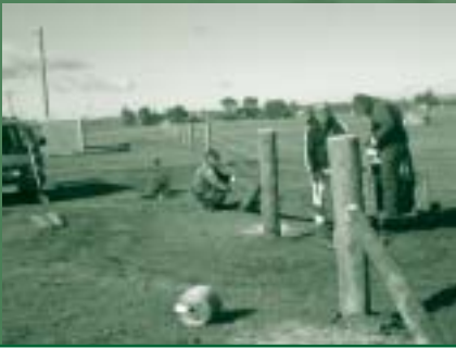
Yunaga Mine Services employees fencing the tree planting areas on the Mount Pleasant site.