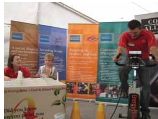
Above: Last year's Bursting with Energy Expo showed how pedal power can generate electricity.

For a full programme of activities and events visit the show's website: www.upperhuntershow.com.au .