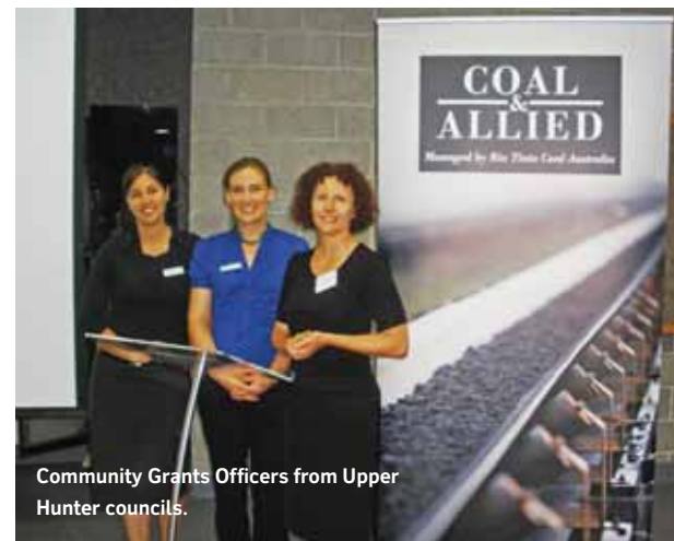
Community Grants Officers from Upper Hunter councils.

"Programmes outside of Council core business have also been expanded and developed through the Grants Officer position; from the Muswellbrook Active-Over-